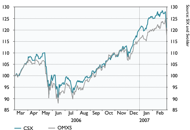
INDEX PERFORMANCE, 12 MONTHS

The buoyant market performance is linked to healthy international growth, corporate profits that exceeded the market's expectations, stable bond interest rates and falling raw material prices. Vigorous growth notwithstanding, inflationary levels are giving no cause for concern. Recent less hawkish statements by the American and Swedish central banks, among others, have also reversed the market's previous expectations of a rise in bond interest rates.